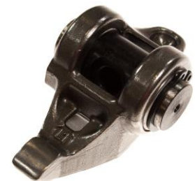
MR-1341 With Centered Rocker Arm Tip

*Refer to Melling Catalog for Application Information