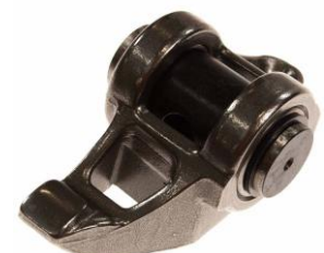
MR-1342 With Offset Rocker Arm Tip

Melling Performance GM LS rocker arms are built from only the highest quality materials and manufacturing processes available. Melling Performance GM LS rocker arms feature an improved OE design ensuring worry free performance and long dependable rocker arm life.