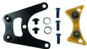
BD417-DBRKT Damper Bracket Kit W/Damper