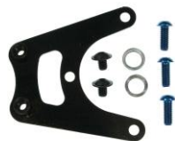
BD417-BRKT Damper Bracket Kit